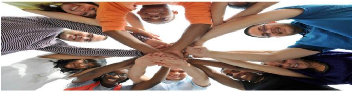
Children and Youth